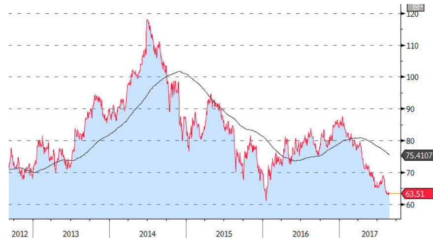
SLB Price over 5Y