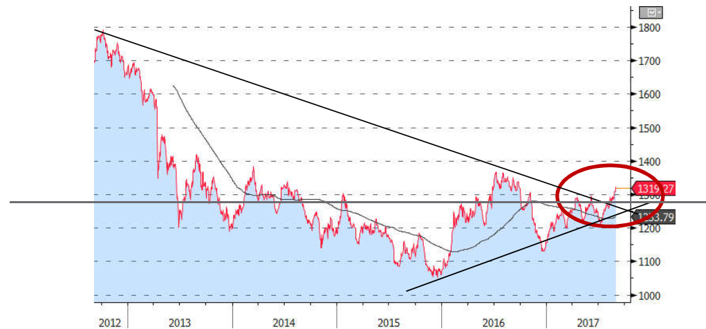
Gold Price in USD over 5Y

Gold: part of a well diversified portfolio